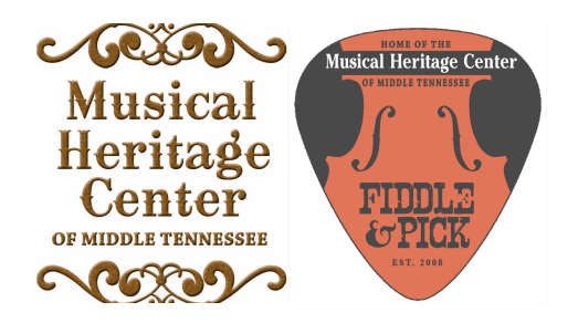
May 2025 Newsletter