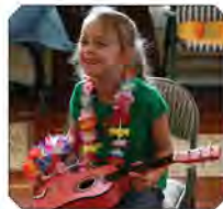
Memories to cherish