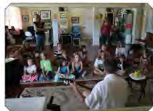
Summer Camp 2010

The Musical Heritage Center, “Fiddle & Pick,” has over 30 music educators who are Nashville professionals, each of whom has a different area of expertise. Private lessons and classes are offered on multiple instruments in a variety of musical styles. Instructors are well-equipped to teach modern styles when requested.