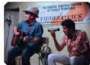
David Ball with his drummer