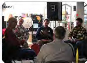
Mandolin Camp 2012